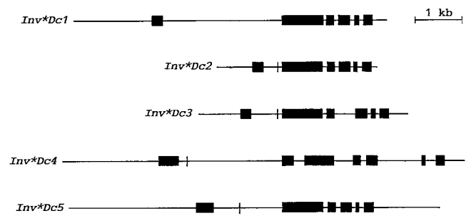
Figure 2. Structural maps of genomic clones for cell wall invertase and vacuolar invertase from carrot. Inv*Dc1 , Inv*Dc2 , and Inv*Dc3 code for cell wall invertase and related enzymes (Lorenz et al., 1995). Inv*Dc4 and Inv*Dc5 code for isoform I and II of vacuolar invertase (M. Hardegger and A. Sturm, unpublished results). The coding regions are represented as black boxes, with intervening and non-coding sequences shown as lines.

From carrot, five genes for acid invertases have been isolated, including the genes for the main form of the cell wall enzyme and the two isoforms of vacuolar invertase (Fig. 2; Sturm, 1996). Comparison of their 5' upstream regions showed no common sequence elements, suggesting independent modes of regulation. Analysis of isoform-specific steady-state transcript levels confirmed this finding and showed markedly different organ- and development-stage-specific expression patterns (Sturm et al., 1995). Similar results were obtained in a study of the expression of genes for one vacuolar and four cell wall invertase isoforms from tomato (Godt and Roitsch, 1997). Interestingly, both carrot (Lorenz et al., 1995) and tomato (Godt and Roitsch, 1997) contain a flower-specific gene for an acid invertase. Together, these findings suggest that plants have evolved a small family of acid invertase genes