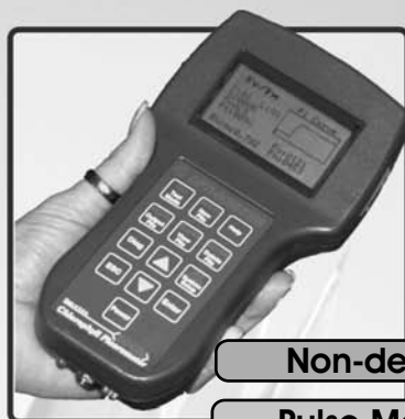
OS-30P Chlorophyll Fluorometer