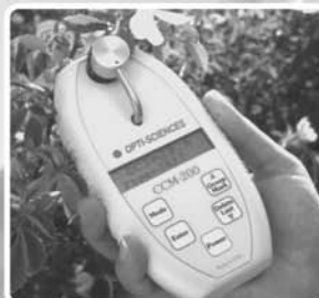
CCM-200 Chlorophyll Content Meter